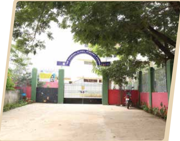
800 M - Sri Sankara Global Academy