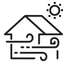
UPVC Window & Ventilator