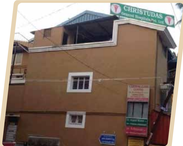
100 m - Christudas Hospital