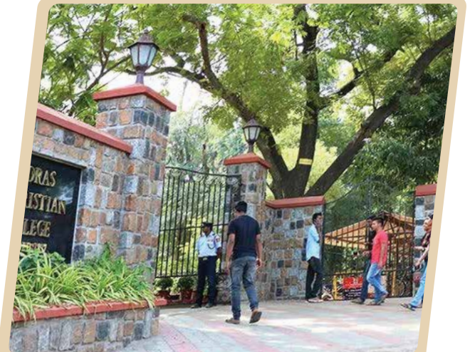
1.8 KM - Madras Christian College