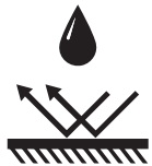
Water Proofing at Bathrooms